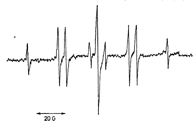
FIGURE 2 E.s.r. spectrum of the radical (32) generated by reduction of o-ethoxybenzenediazonium fluoroborate (24)

Because of our failure to detect product (14) of 1,5-intramolecular hydrogen atom transfer in radical (8b) we examined some related saturated systems (15)—(17), in