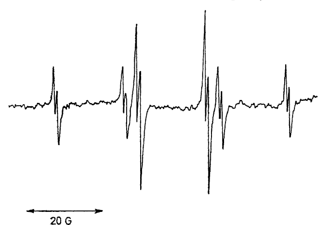
FIGURE 1 E.s.r. spectrum of the radical (6b) generated by reduction of o-allyloxybenzenediazonium fluoroborate (19)

value (see Table) of the signal enable the radical responsible for it to be identified as the product (6b) of 1,5-cyclization of o-allyloxyphenyl radical (5b). Four other radicals which could possibly be formed in this system, viz the aryl radical (5b), ^{21} the 1,6-cyclization product (7b), the allylic radical (30), ^{22} and radicals of the general type (31), would each show higher multiplicity.